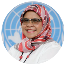
Maimunah Mohd Sharif