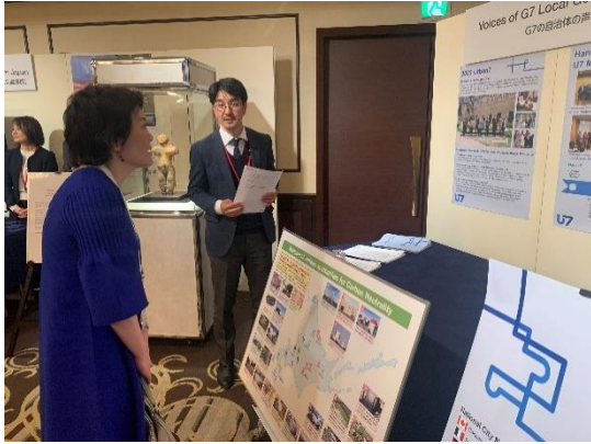
Miki Yamada, State Minister, Ministry of Environment of Japan