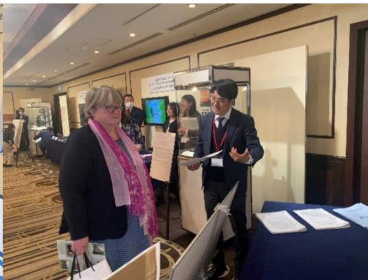
Thérèse Coffey, Secretary of State for Environment, Food and Rural Affairs, UK