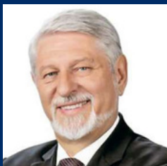
Mayor Stevčo Jakimovski