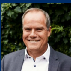
Mayor Eckart Würzner