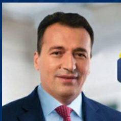
Mayor Blerim Bexheti