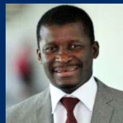
Mayor Manuel de Araujo