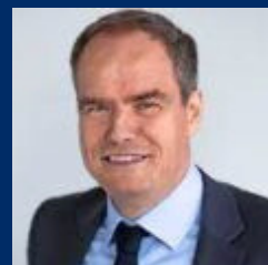
Mayor Eckart Würzner