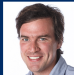
Mayor Mathias de Clercq