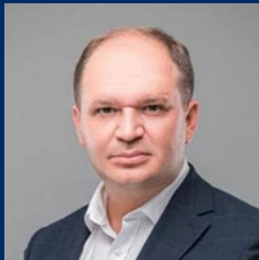
Mayor Ion Ceban

Between November 2023 and August 2024, the GPM welcomed the following new members: