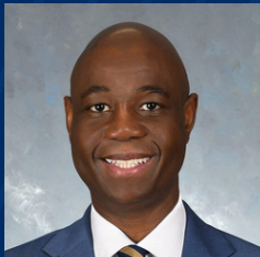
Mayor Alix Desulme